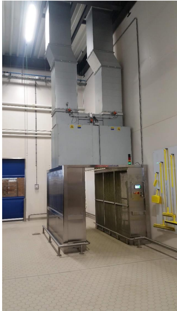
Example of Ducting from a Magnacooler